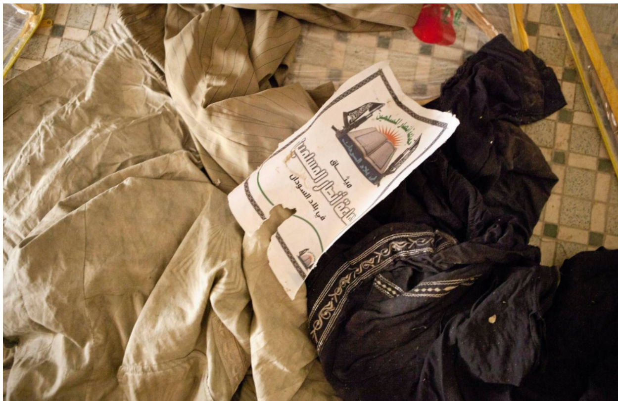
Ansaru leaflet found in Belmokhtar's compound in Gao in February 2013