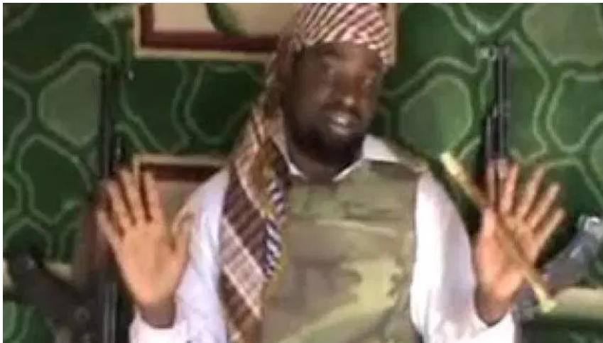
Boko Haram leader, Abubakar Shekau